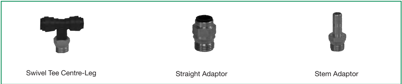
Swivel Tee Centre-Leg