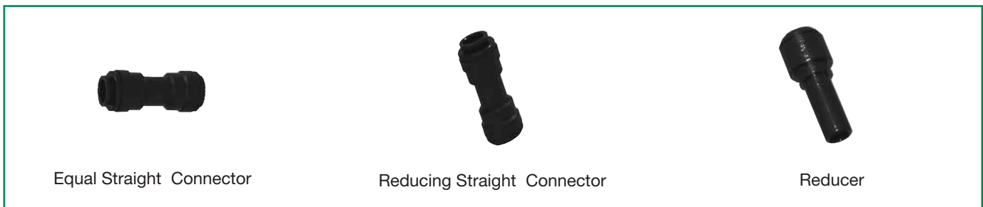
Equal Straight Connector